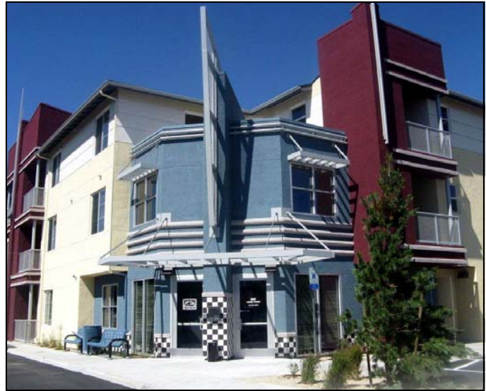
River Place’s front view

River Place Apartments total project cost was around $10 million with the Nevada Housing Division providing the tax credits for an equity investment of $5,665,035 with another $1,450,270 of credits issued through the ARRA stimulus funds, the tax credit exchange program (TCEP).