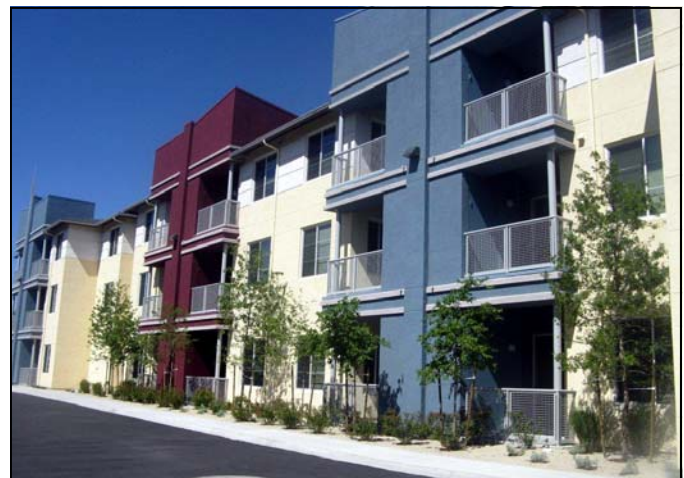
River Place’s side view of the three-story complex