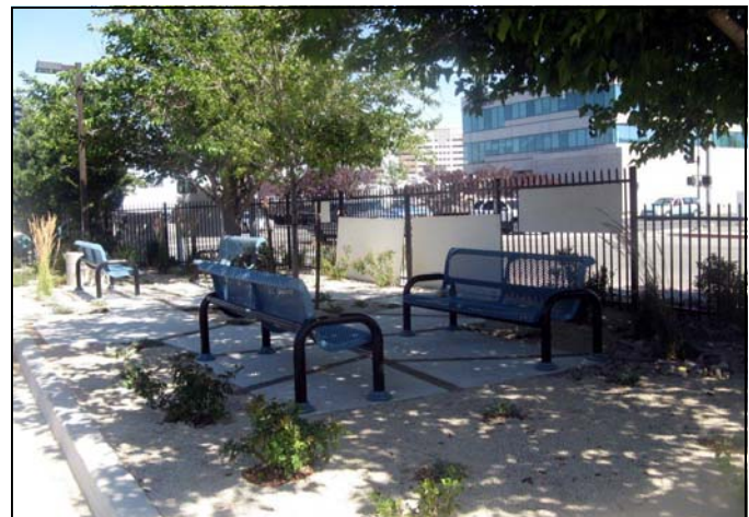
River Place’s quiet outdoor space for the aged 55+ residents