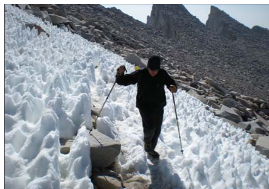
Pictured top left, Art celebrating his 'reaching the top'.