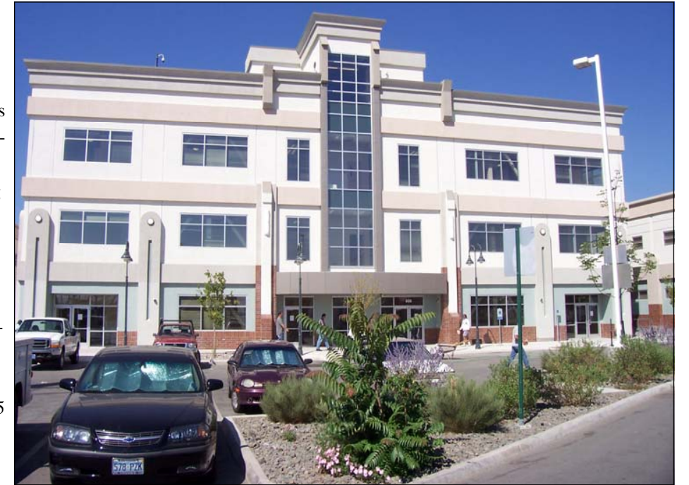
Community Assistance Center's family shelter