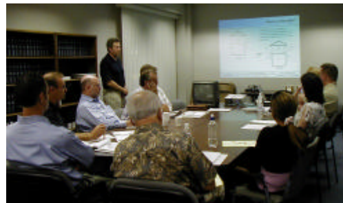
NHD mandatory energy required workshops were held for all tax credit awards.