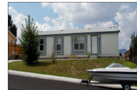
Homes, like the one on the left, provide transitional housing for the homeless in Elko.

HOME's purchase of homes in Elko provided assistance to serve families at or below 60% AMI. Two of the purchased rental units have been leased to single moms with kids.