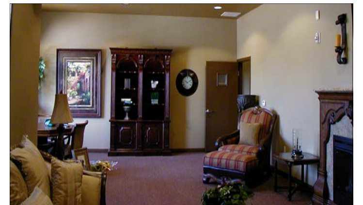
The club house provides a reading and quiet room.