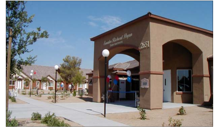
Senator Richard Bryan Apartments blends into the desert scene of the Las Vegas area.