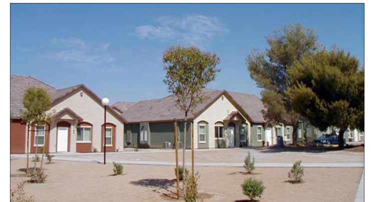
The senior development offers one- and two-bedroom size units within various desert-themed color coordinated buildings.